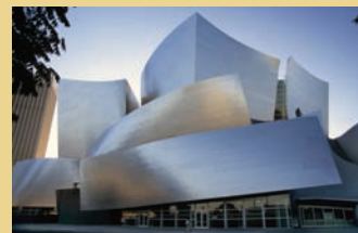
Walt Disney Concert Hall

Los Angeles is the only city in North America to have hosted the Summer Olympics twice. Downtown LA is the largest government center outside of Washington, D.C. Los Angeles has the only remaining wooden lighthouse in the state and the largest historical theater district on the National Register of Historic Places.