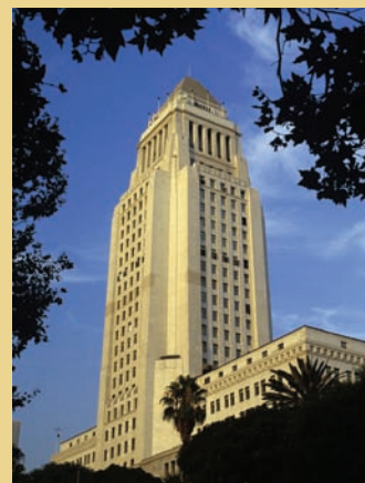
Los Angeles City Hall