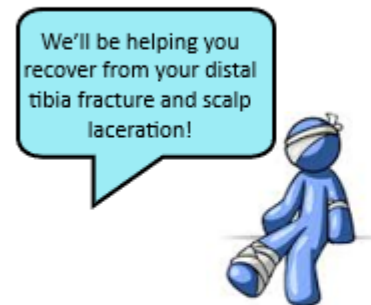
Workers' Compensation Perspective of Injury

Everyone experiences stress and has life challenges to cope with. A 1999 Surgeon General's report estimated that only 17% of the US population is in a state of "optimum" mental health. 3 The likelihood is high that some workers' psychosocial states may warrant attention during recovery, based on their individual situation and coping skills.