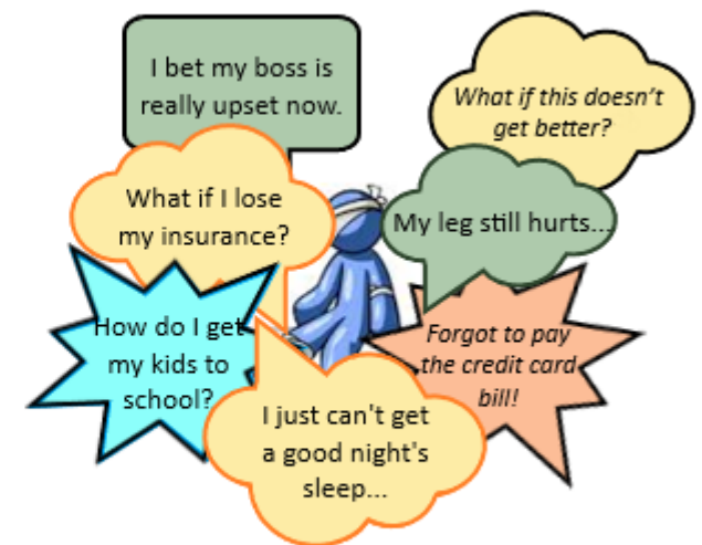
Worker's Perspective of Injury