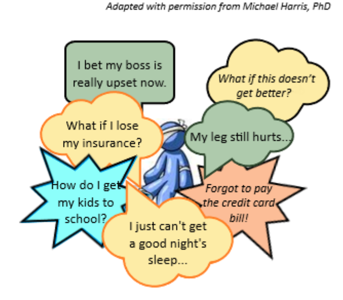
Worker's Perspective of Injury

Biopsychosocioeconomic (BPSE) aspects involved in a work injury reflect the biological, psychological, and socio-economic factors that may facilitate or impede recovery. BPSE factors contribute to potential barriers, as well as concurrent mental health (MH) conditions (e.g., anxiety or depression). When combined with a debilitating injury, BPSE factors may become more significant and influence recovery, and at that point, they must be addressed.