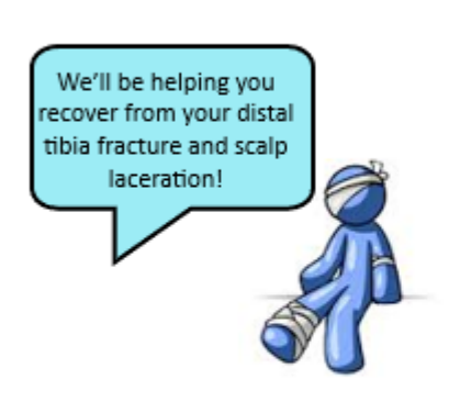
Workers' Compensation Perspective of Injury

Everyone experiences stress and has life challenges to cope with. A 1999 Surgeon General's report estimated that only 17% of the US population is in a state of "optimum" mental health.<sup>3</sup> The likelihood is high that some workers' psychosocial states may warrant attention during recovery, based on their individual situation and coping skills.