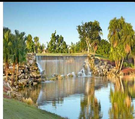
The Hyatt Regency Bonaventure

Plan to join us Oct. 30 - Nov. 1, 2008 in southern Florida at the Hyatt Regency Bonaventure!