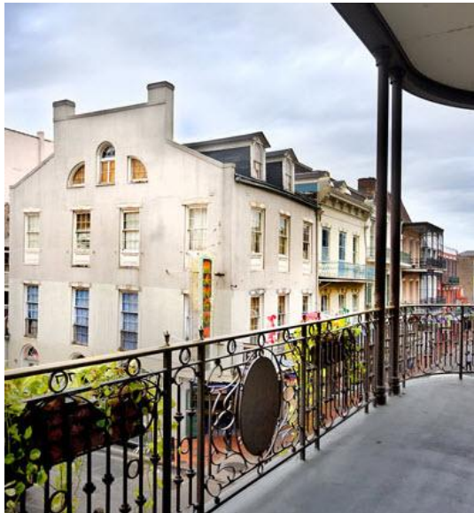
Astor Crowne, New Orleans

Make sure to ask your chapter leader whether they are going to this important leadership gathering!!!